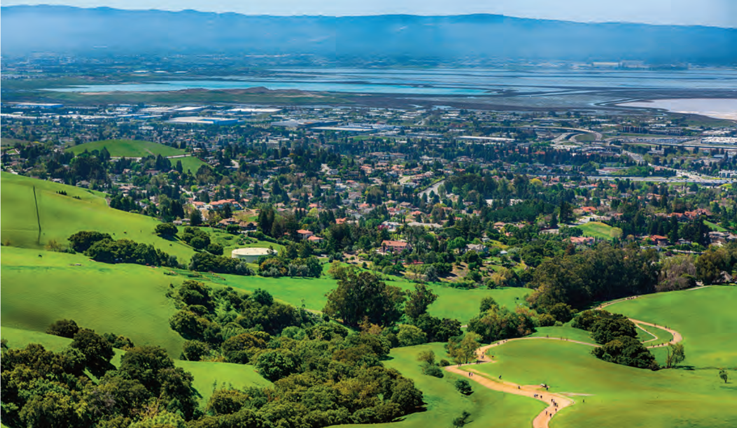
Silicon Valley from hiking trail at Mission Peak: DSPT lies at the heart of the world's most renowned innovation and discovery.

academic and apostolic vocations. The school is a member of the Graduate Theological Union, which makes possible productive dialogue between a variety of religious and cultural backgrounds, and students can take courses and access libraries at the University of California, Berkeley.