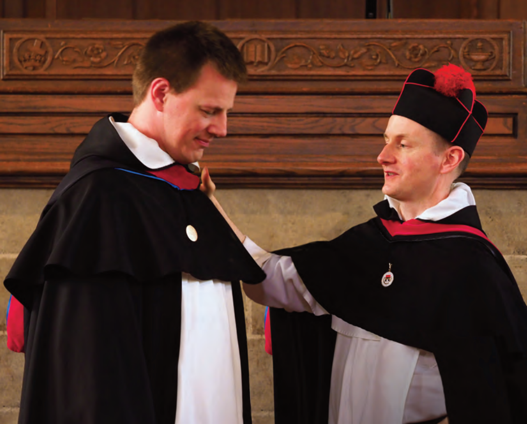
(L) A DSPT graduate is hooded by his academic advisor. (below) DSPT builds on a rich history of helping to form friars since 1932.